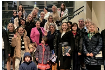
Some of over 200 recipients of Nutcracker Kids tickets at the Royal in 2023