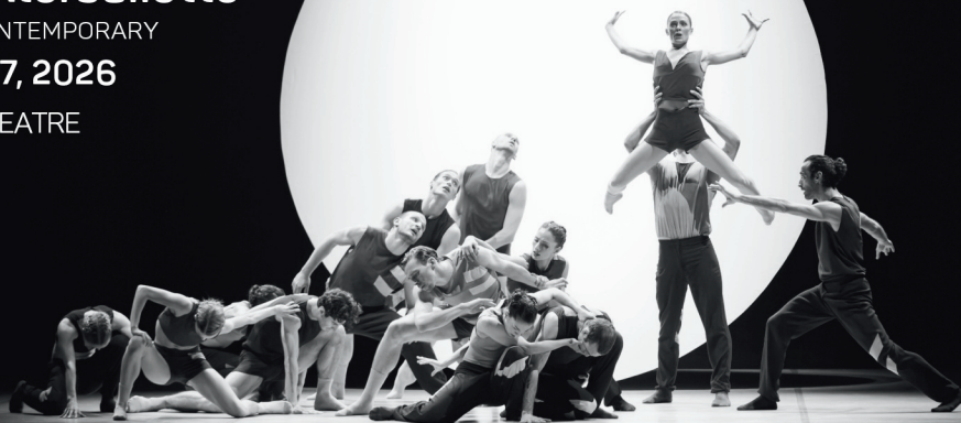
CCN/Aterballetto in Rhapsody in Blue